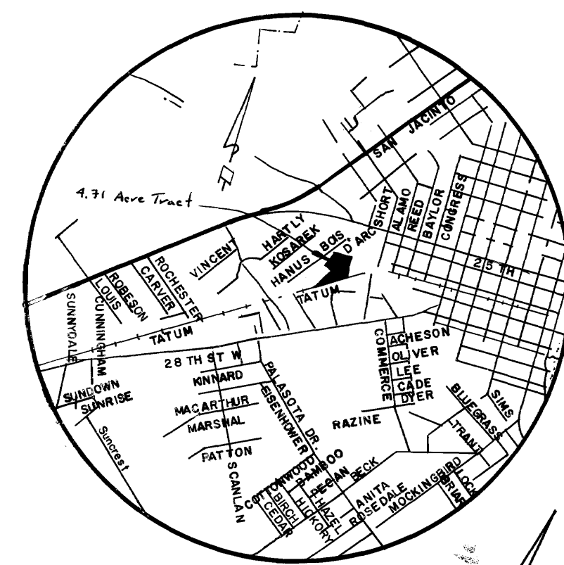
LOCATION MAP Not to Scale

THENCE: N 42° 42' 01" E - 804.30 feet along said Nichols Street line to the PLACE OF BEGINNING and containing 4.71 acres of land, more or less, according to a survey made under the supervision of Donald D. Garrett, Registered Public Surveyor, No. 2972 in March, 1982.